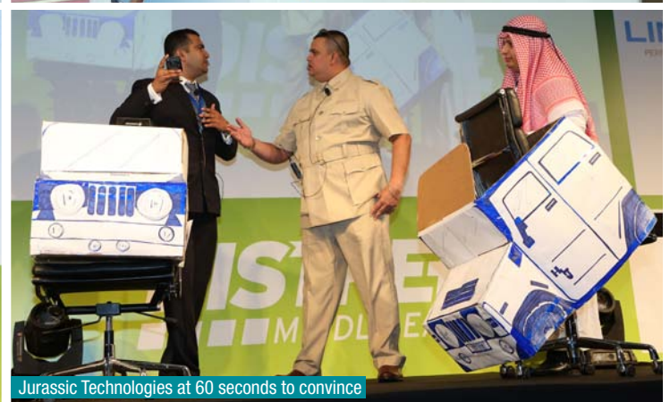
Jurassic Technologies at 60 seconds to convince