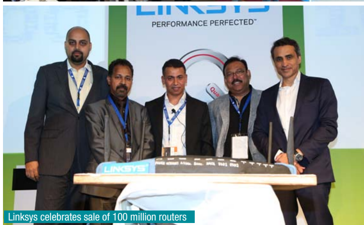
Linksys celebrates sale of 100 million routers