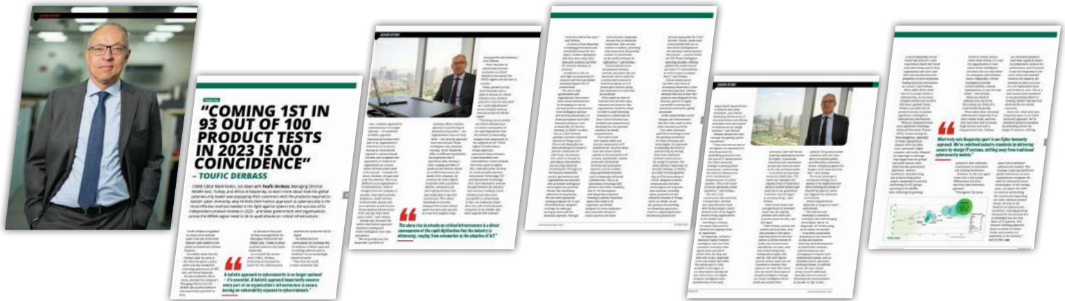
Full page insert card