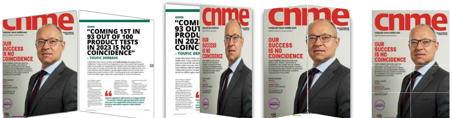
Poster 8 page fold out (front and back)