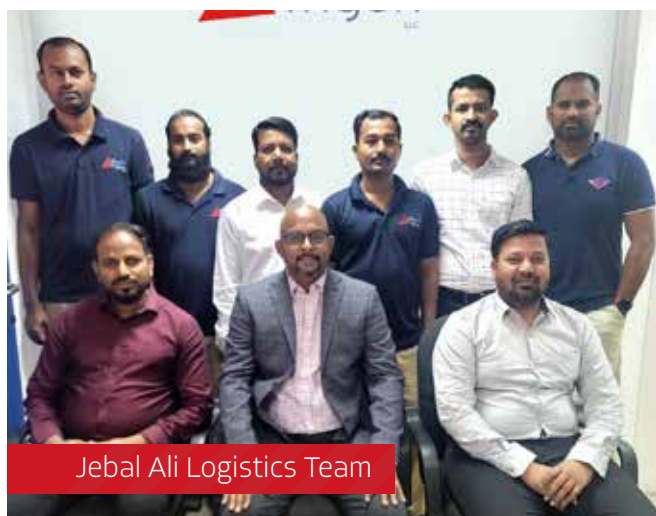
Jebel Ali Logistics Team