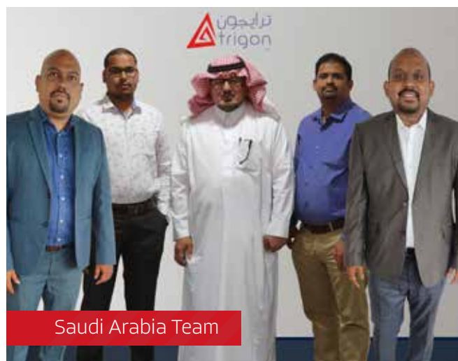
Saudi Arabia Team