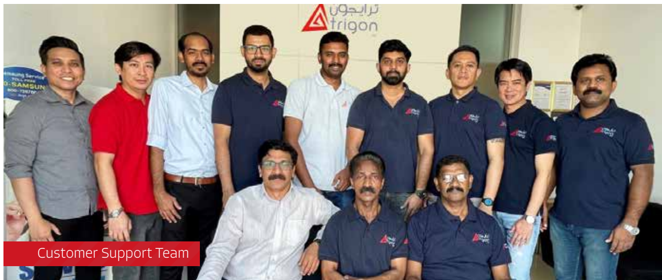
Customer Support Team