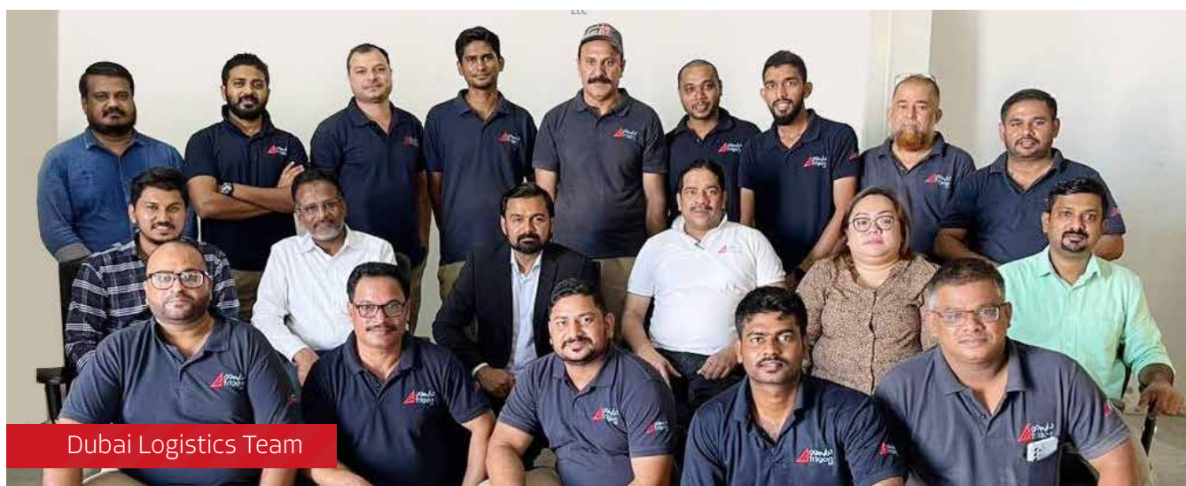
Dubai Logistics Team